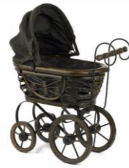
wood and metal pram