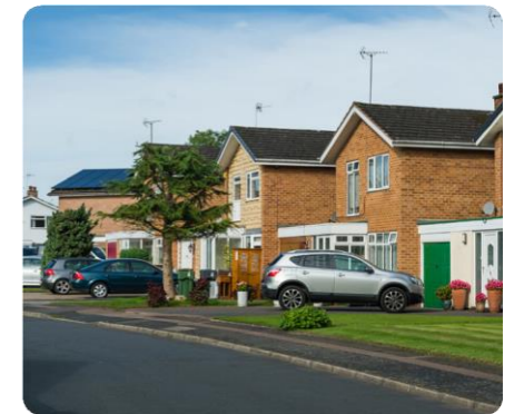
A street today.