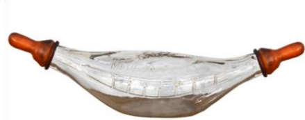
Victorian baby bottle

An artefact is an object from the past. Museums often display historical artefacts. Artefacts can tell us about how people used to live. Everyday objects like baby bottles, clothing, toys and books can tell us about childhood in the past.