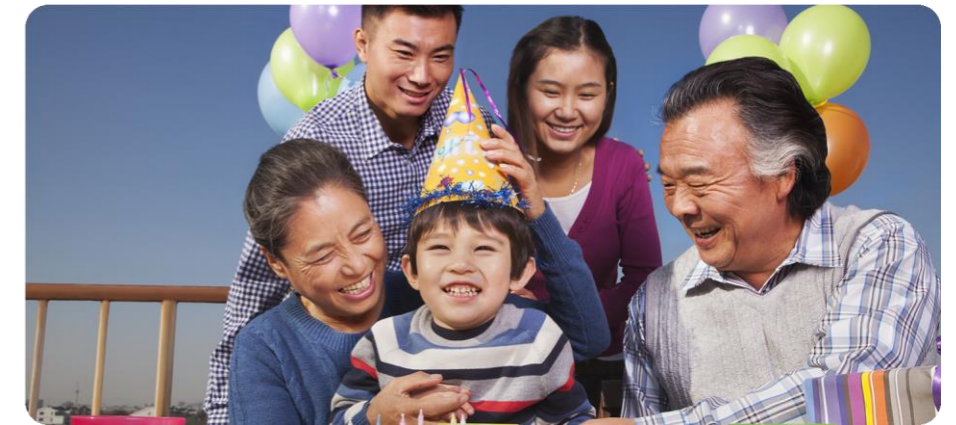
Birthdays happen every year.

Important life events include birthdays, religious festivals or family celebrations. Some life events happen every year and some happen at certain stages of human life.