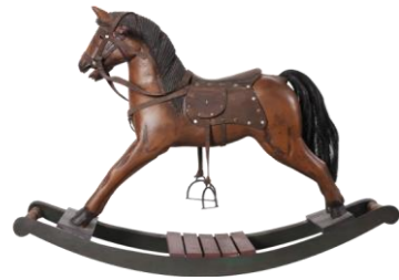
wooden rocking horse