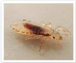
magnified head louse

Head lice are ectoparasites that live on the human scalp. They get nutrients by biting through the skin and drinking human blood. Head lice make the head feel itchy. Tapeworms are endoparasites that live in the human gut. They attach onto the inside of the gut wall and absorb nutrients from the food a person eats. This can cause pain, diarrhoea, vomiting or tiredness for the person.