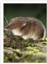
Shrews are both predators and prey. They eat insects and worms and are eaten by birds of prey and some mammals, such as foxes.