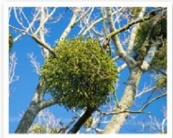
mistletoe growing in a ball on a tree

Some plants are also parasites because they get nutrients from other plants. Mistletoe grows in branches of trees. It inserts part of its root through its host's bark to get water and minerals. Eyebright is a small flowering plant that gets some of its nutrients from the roots of grasses that grow nearby.