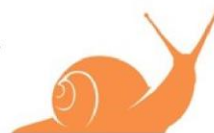
garden snail primary consumer