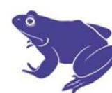
common frog secondary consumer