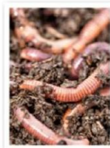
Worms are decomposers and prey. They eat dead plants and animals. They are eaten by birds and some small mammals, such as shrews.