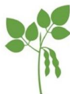
bean plant producer

Food provides energy for all living things. Energy is needed for life processes, including breathing, growth and movement. Food chains show how energy passes from one plant or animal to another. Most plants make their own food. They are called producers. Animals that eat other plants or animals are called consumers.