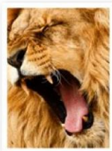
Lions are apex predators. They eat large mammals, such as zebras and young elephants.

A predator is an animal that hunts, kills and eats other animals. An apex predator is at the top of a food chain and isn't hunted by any other animal. The animals that predators hunt and kill for food are called prey. A decomposer eats dead plants and animals, releasing nutrients into the soil for plants to take in through their roots. Some bacteria, fungi, insects and worms are decomposers.