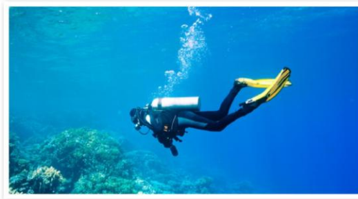
Deep sea diver using an aqua-lung to breathe

Ocean diving can be dated back to 4500 BC when people in the coastal areas of Greece and China dived for food. Cousteau's invention of the aqua-lung meant divers could take air with them, spending more time under the water and going deeper than ever before. Cousteau used the aqua-lung to explore and film the underwater world more freely.