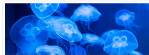
Jellyfish displaying bioluminescence

Some marine animals have chemicals in their cells that make light or bacteria that live on them and produce light. This is called bioluminescence. Bioluminescence can be used as defence, camouflage, to attract prey or to see in the dark. The most common colours of bioluminescence are blue, green and red.