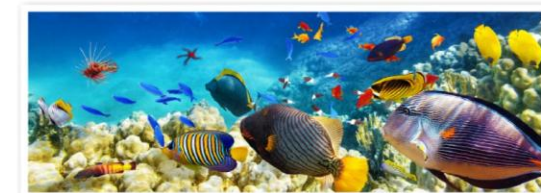
Tropical fish in a coral reef

Corals are marine invertebrates that live in large groups called colonies. Some species produce a hard exoskeleton that forms into a coral reef. The Great Barrier Reef, on the north-eastern coast of Australia, is the longest and largest coral reef in the world, with over 600 types of coral. Corals are at risk of being destroyed by climate change, pollution and consumers.