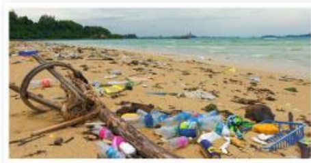
Plastic waste polluting the beach at Kota Kinabalu, Malaysia.

A lot of the waste that is thrown away goes into the world's seas and oceans. This is called pollution. Plastic waste takes a long time to break down and tiny parts of it will never go away. Plastic waste can be harmful to living things.