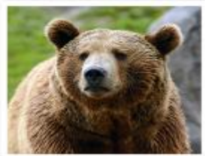
Brown bears are mammals.

Animals can be sorted into six different groups. These are mammals, amphibians, birds, fish, reptiles and invertebrates.