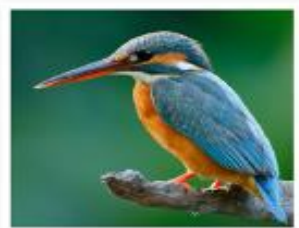
Kingfishers are birds.