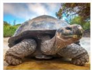
Tortoises are reptiles.