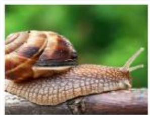
Snails are invertebrates.