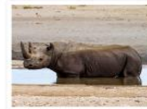
Western black rhino