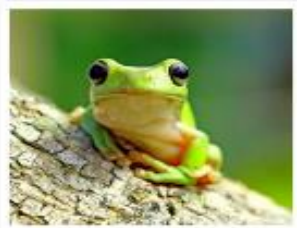
Frogs are amphibians.