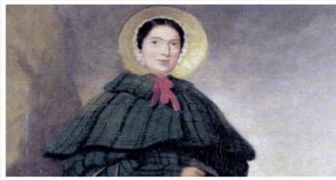
Portrait of Mary Anning

Mary Anning was a British palaeontologist, who was born in 1799. She made many important fossil discoveries.