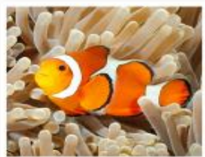
Clownfish are fish.